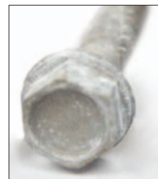
UltraCon SS4 anchor