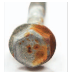
ITW Tapcon 410 SS anchor